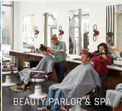
BEAUTY PARLOR & SPA