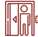
6 Passenger Lift